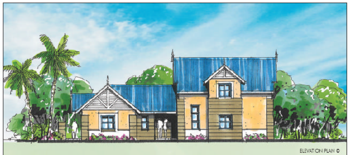
ELEVATION PLAN ©