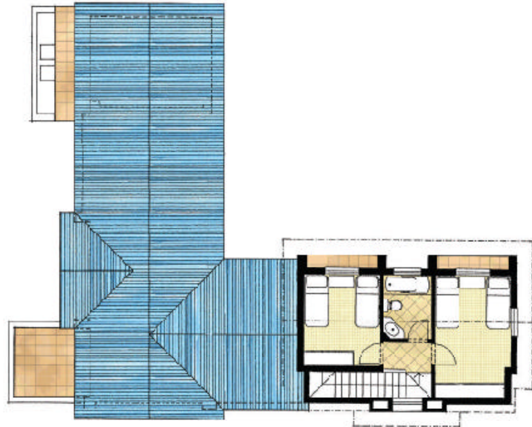
FIRST FLOOR PLAN ©