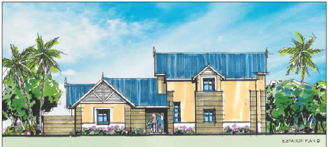
ELEVATION PLAN ©