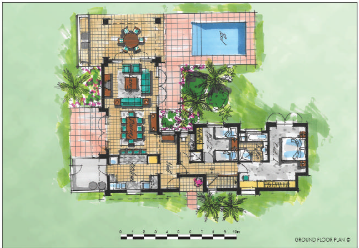
GROUND FLOOR PLAN ©